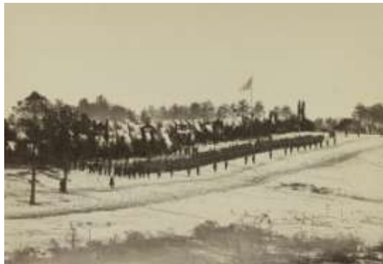
Winter Camp of 2 nd Maine Infantry, Camp Jameson, (date unknown)