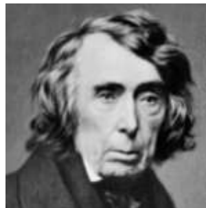
Chief Justice Roger Brooke Taney