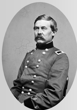
General John Buford