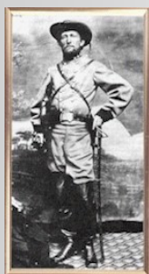
John S. Mosby