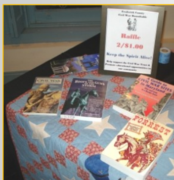
A selection of the items offered at the March Raffle Table. Money raised from the raffles is used to support our outreach programs-thanks to everyone who participated!