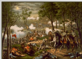
Battle of Chancellorsville