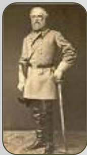
Gen. Robert E Lee

Thursday, Apr. 18, at 7:30 PM, National Museum of Civil War Medicine, 48 E. Patrick St., Frederick, MD