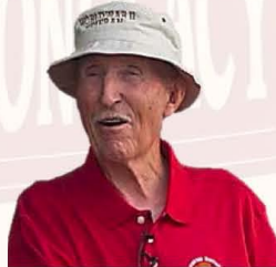
"Fields of Honor: Pivotal Battles of the Civil War" "The Battle of Monocacy"

Renowned historian and battlefield guide Edwin Bearss recounting his significant role in the preservation of Monocacy National Battlefield.